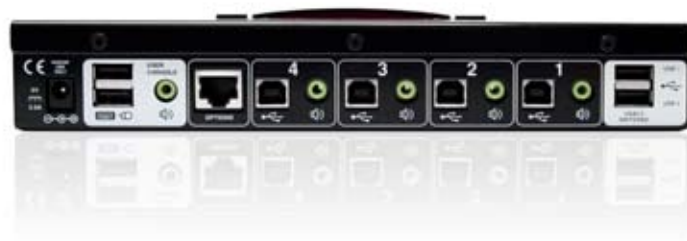
Local, Remote and Global Computer Control