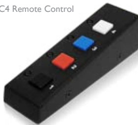
RC4 Remote Control