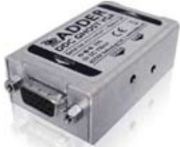
If you have DDC problems with existing switches, the DDC Ghost is a simple remedy

this area the safest option is to choose a KVM switch that clones its DDC EDID data from the monitor. One aspect that you won't often see on a KVM switch vendor's spec sheets is the switch's latency characteristic but this is nevertheless important (latency is the time that the switch takes to process the keyboard and mouse data). This can vary significantly between switches and the user can see a high latency switch because the mouse will have a strangely spongy feel to its movement which makes the switch awkward to use. And don't forget that the number of servers in your server room will almost inevitably grow significantly over time so it's important to buy a KVM switch solution that has a designed-in expansion or cascade facility - don't think that you can just connect one to another - this may be electrically possible but if it's not a fully designed-in cascade strategy it will leave you with a whole load of operational confusion.