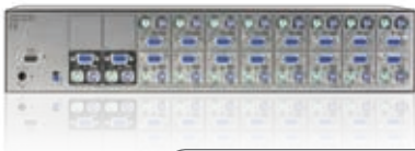
Example rear panel of a Matrix switch

Once you've sorted out the basic KVM switch requirements, you will need to decide the class of KVM switch that you need. Matrix switches enable two or more users to work on different computers at the same time and tend to be specified when the numbers of computers becomes larger. For many small server room requirements a single channel KVM switch may well be sufficient, particularly when you bear in mind that many computers have built in remote access capabilities too and that these are typically used alongside a KVM switching function. But perhaps the most important decision when choosing a KVM switch for a small server room is whether or not you want built-in remote access capabilities.