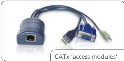
CATx 'access modules' allow you to connect any type of computer to the switch