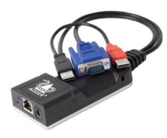
ADDERLink INFINITY 100T - VGA