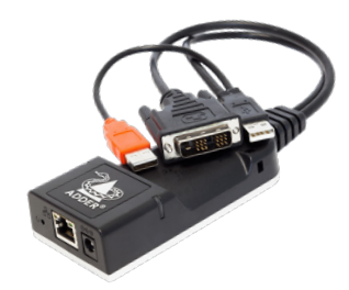
ADDERLink INFINITY 100T - DVI

• Ethernet specifications rules apply 100m/300ft maximum run