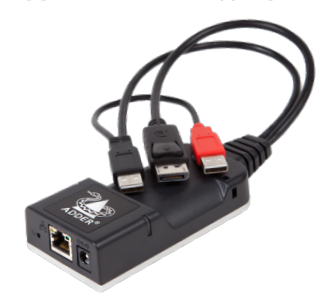
ADDERLink INFINITY 100T - DisplayPort™