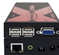
ADDERLink X-USB PRO - Remote