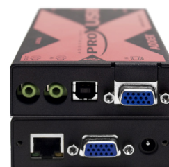
ADDERLink X-USB PRO - Local