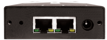
ADDERLink X200 - Front