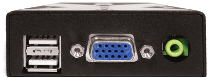
ADDERLink X200 - Back