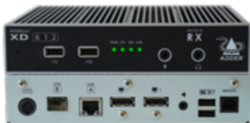
ADDERLink XD612 RX - Front & Rear

CAT6 is recommended for CATx extensions. CATx extensions are limited to 2 short patch connections. Patch cables should be CAT6 or better.