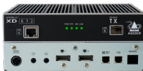
ADDERLink XD612 TX - Front & Rear