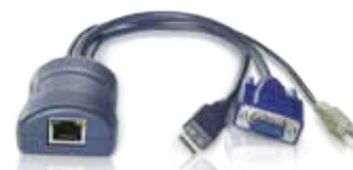
Example CAM: CATX-USBA

CAM: Computer Access Modules DisplayPort® connector, USB plus audio: CATXDP-USBA Mini DisplayPort® connector, USB plus audio: CATX-MDP-USBA VGA and PS/2: CATX-PS2 VGA and USB: CATX-USB VGA, Sun plus audio: CATX-SUNA Console extension: X200